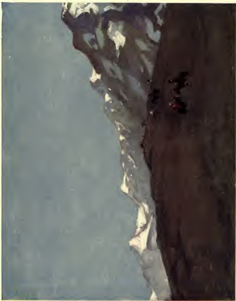
THE SNOW-CLAD ANDES. Page 3.