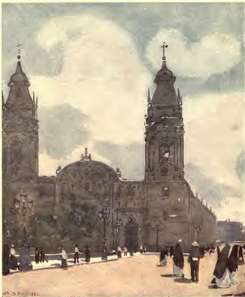
THE CATHEDRAL, LIMA. Page 73.