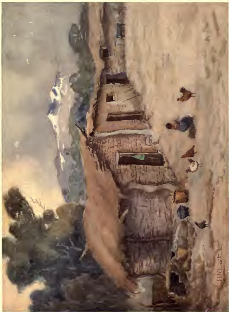
A PAISANO'S HUT ON THE CHILIAN FRONTIER. Page 62.