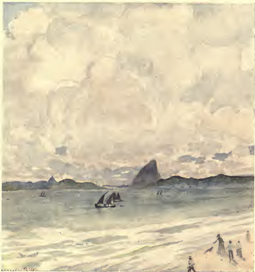
THE SUGAR LOAF, RIO HARBOUR. Page 45.