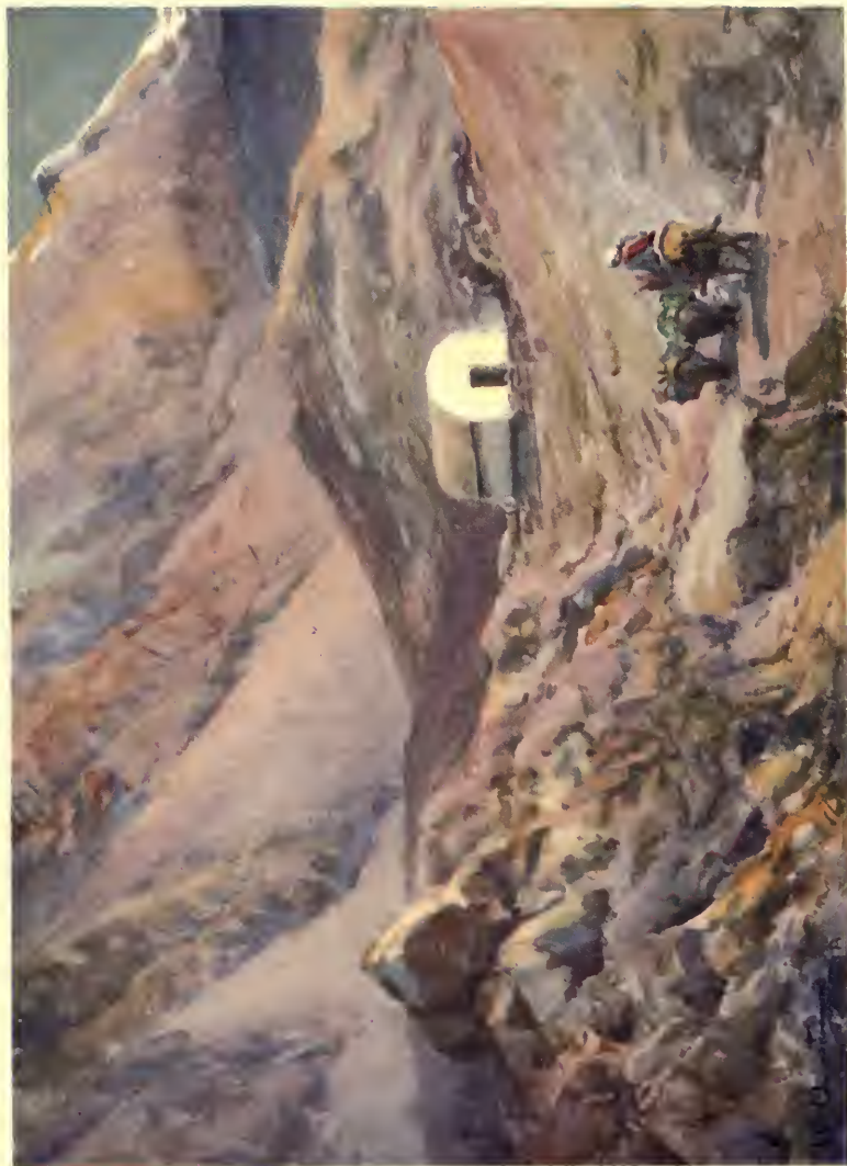
OLD REFUGE HUT IN THE ANDES. Page 61.