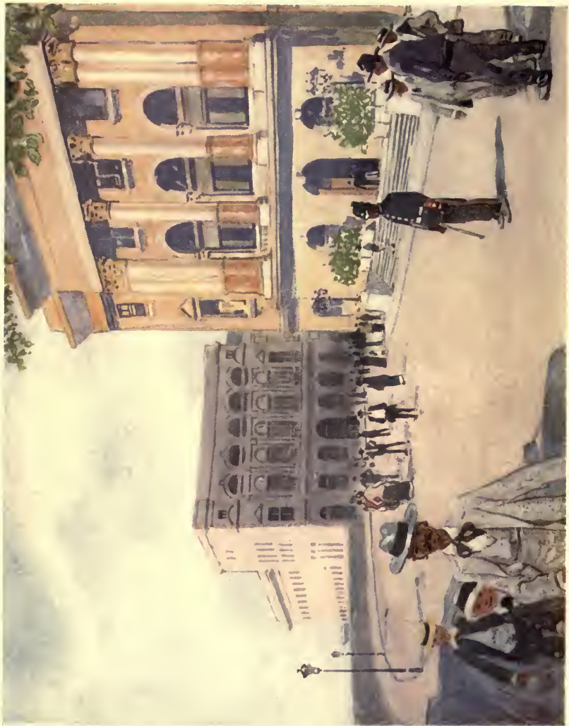
THE PALACE SQUARE, SAO PAULO. Page 47.