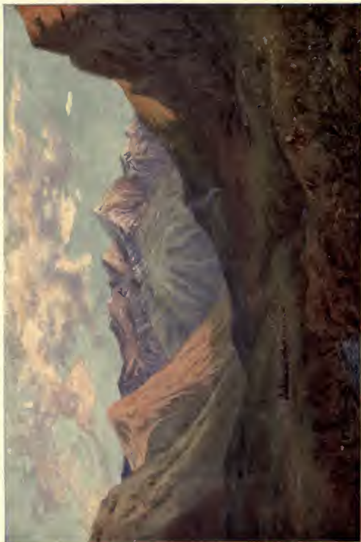
MULE TEAM LEAVING PUENTE DEL INCA. Page 61.