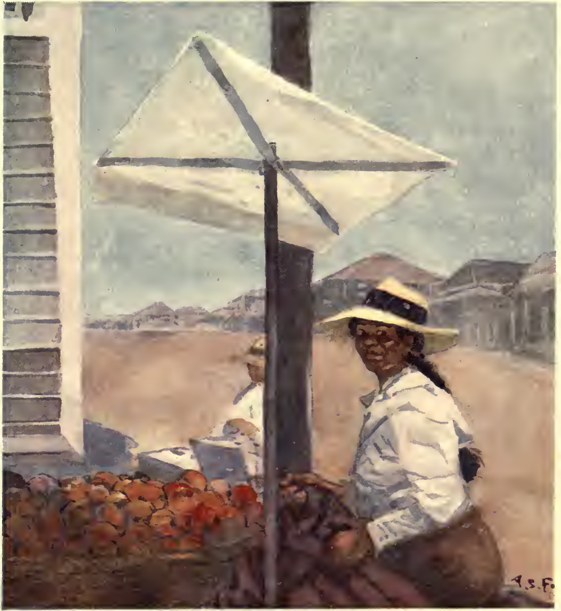
A FRUIT STALL IN MOLLENDO, PERU