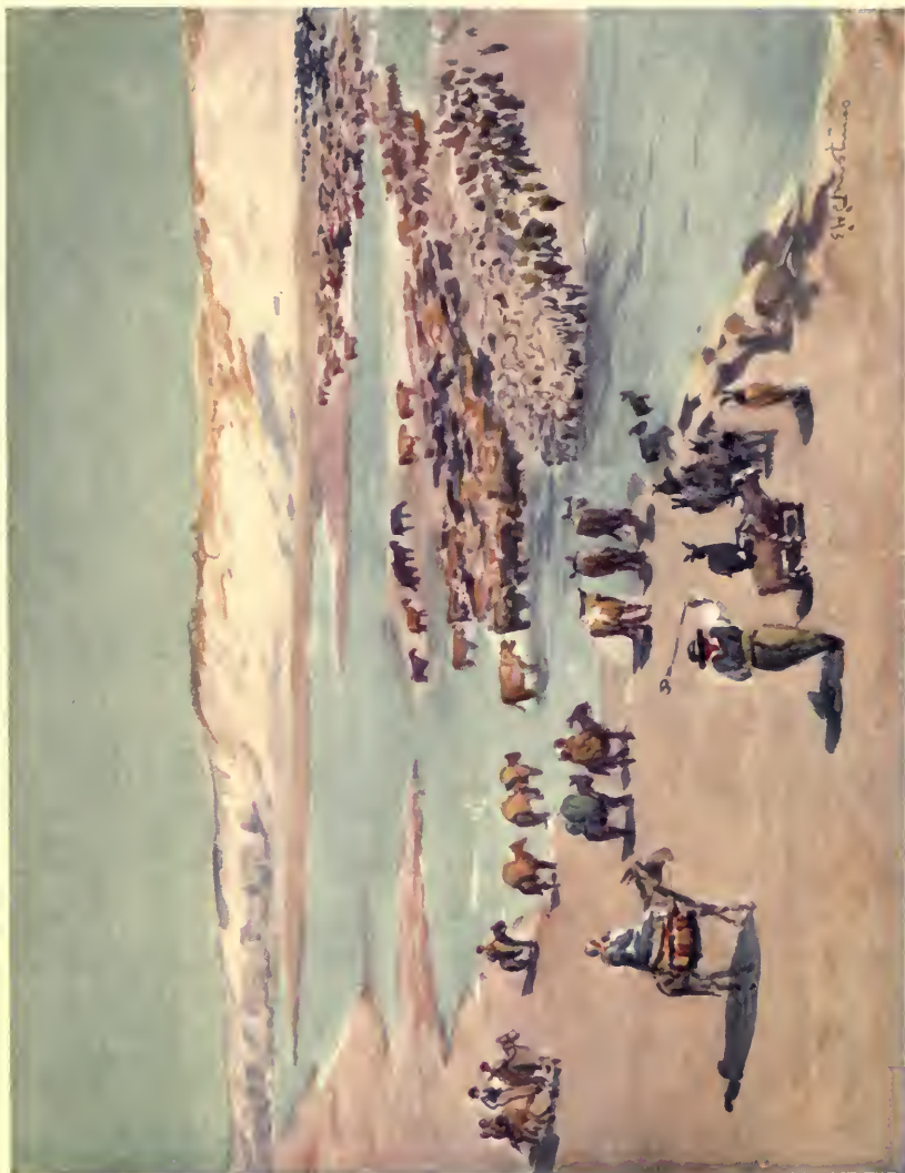
CHILENOS TREKKING ACROSS THE FRONTIER. 1792/03.