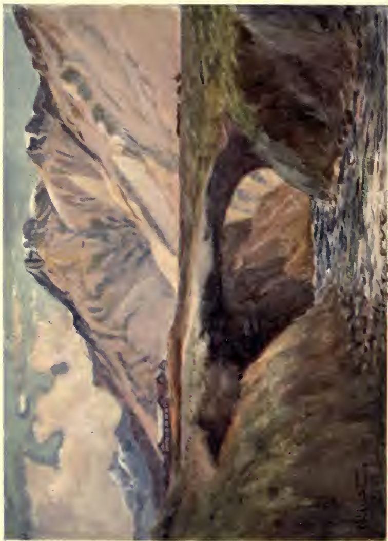
PUENTE DEL INCA, THE FAMOUS NATURAL BRIDGE. Page 61.